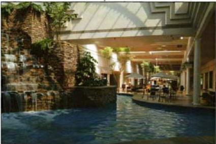
Interior Water Feature