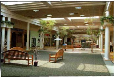
Interior Hallway Spaces